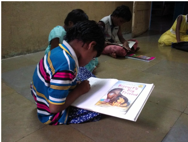
Photo 1: Library Studies training session with Rainbow Homes Photo 2: Reading a Pustakaar book at SRD Rainbow Home